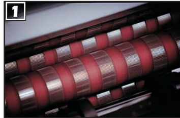
1 Optimal performance. Challenge combination fold rollers deliver crisp, tight folds and provide superior control of slick paper stocks.