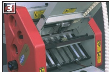
3 Easy access. A swing-away feed table allows easy access to the lower fold plate.