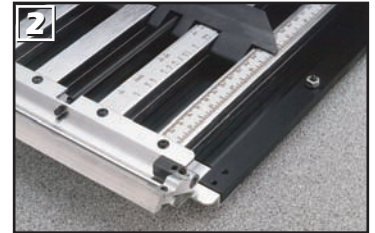
2 Quick & easy set-up. Flip-up swing deflectors allow set-up changes without fully removing fold plates.