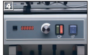
4 Convenient operation. Accessible from either side, the control panel includes a counter and reset button.