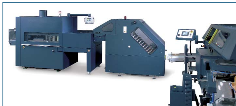
BB4040 + three knife trimmer

it can be reloaded on-the-fly without having to halt the machine. The belt conveyor terminates in a four-way stacker. This lets the adhesive binder be easily operated by a single person.