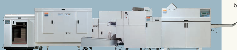
HCSx + BPRFx + BB2005 + BCFx + BDFx

The Bourg Book Factory allows you to produce finished booklets easier, faster and more flexibly than ever before.