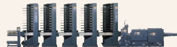
TD-d + BST-d left + BST-d add. + BST-d add. + BST-d add. + BST-d right + AGR-t + PAS-t + TR-t