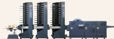
C/C mir. + BST-d left + BST-d add. + BST-d right + SBM4