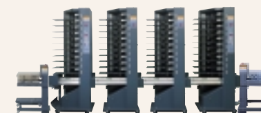
TD-d + BST-d left + BST-d add. + BST-d add. + BST-d right + TD-t