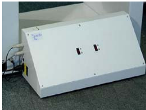
SPEDO WEB LOOP CONTROL