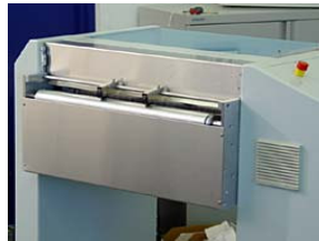
SPEDO FORMS ACCELERATOR