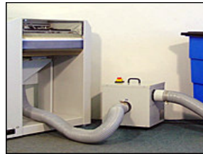
SPEDO WASTE EXTRACTION UNIT